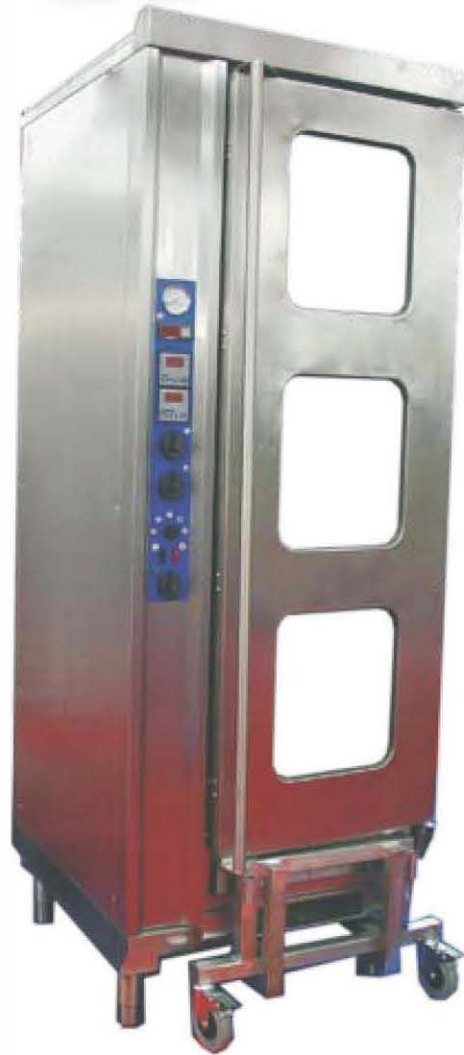
CONV - 20 E COMP -20 E