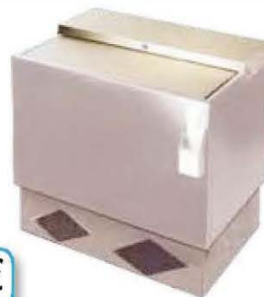
Boottle cooler (18.092.012)