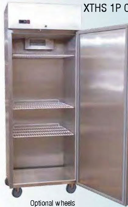
XTHS 1P CLASSIC