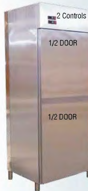
XTHS 1P 2D 2T