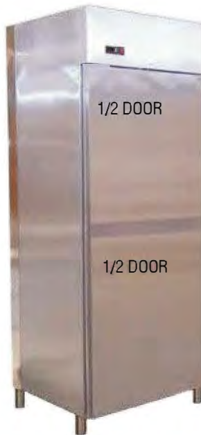
XTHS 1P 2D