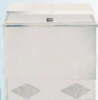
Glass cooler (18.092.011)